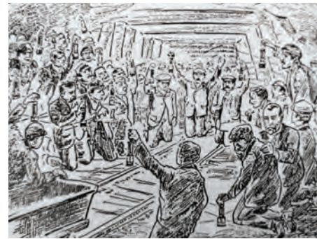
An illustration of an underground prayer meeting near Llanelli.