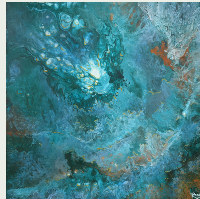
Left: Intricate Shallows