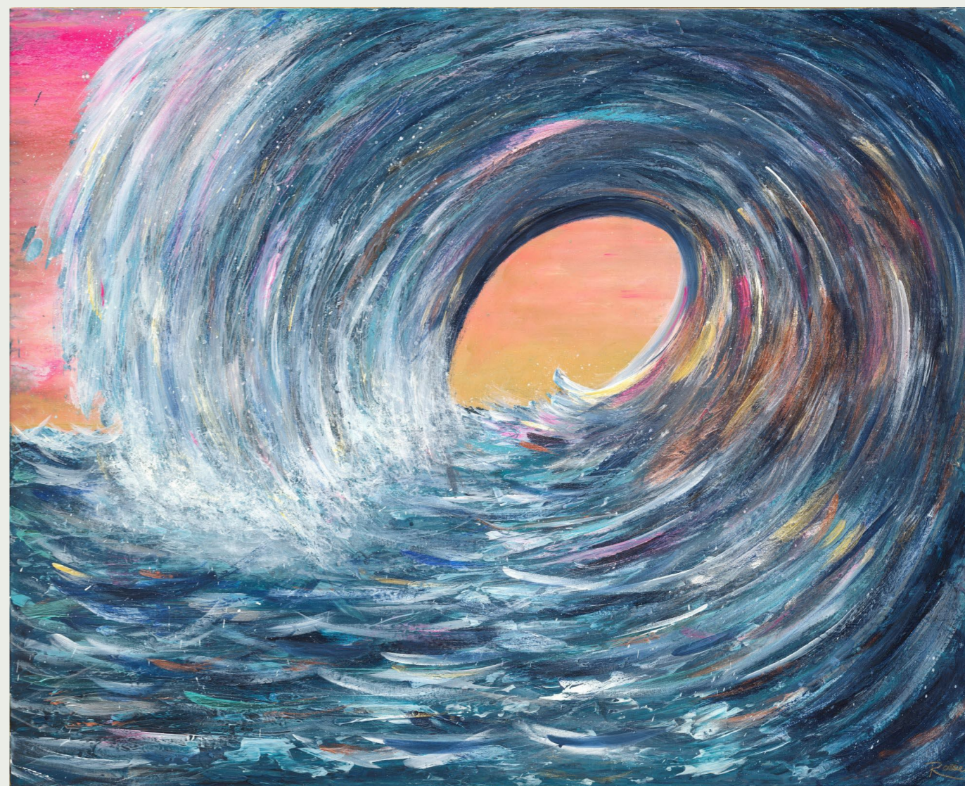
Below: You Are Loved